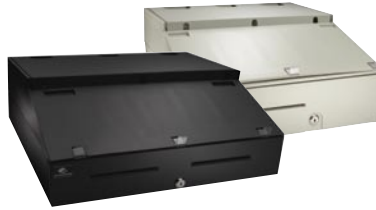
Black / Cloud White

Designed to help bring all the components of a POS workstation together, the Cash Drawer Caddy System includes a heavy duty drawer, a rugged injection molded Base and a sturdy steel Cap. The system allows for peripherals to be placed with left or right-hand orientation and accommodates nearly all major POS keyboard, printer and monitor brands.