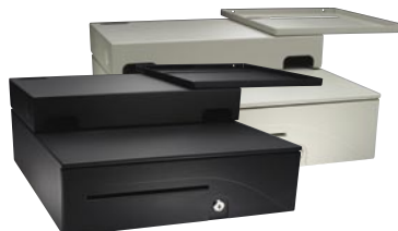
Black / Cloud White

A compact foundation for your POS system, the POS-Integrator provides a solution to the problem of assembling systems on a Series 100 cash drawer. Exploiting the use of a narrow footprint, a riser and printer tray expand the width to accommodate various receipt printers and a full size monitor. Cable management is provided to route and hide peripheral cables.